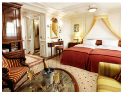
Category C. From