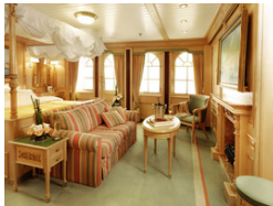
Category B. From