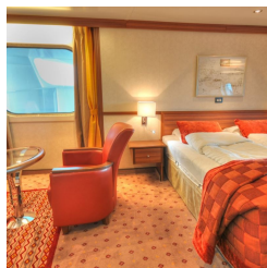
Expedition Suite. From