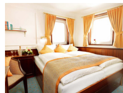
Category 1. From

Cabins with a bath, shower and W/C Cabins with a shower and W/C Mass