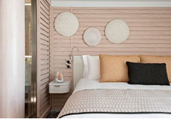
Deluxe Suite Deck 6