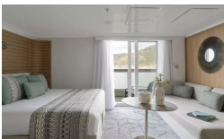
Grand Deluxe Suite Deck 6