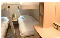
Polar Inside. From