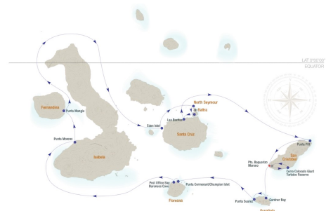
SOUTHEASTERN ITINERARY MAP

Our Southeastern Galapagos Yacht Itinerary begins with an introduction to the beautiful beaches of the archipelago over at Las Bachas. The following day, we'll travel down to San Cristobal Island, where you'll get a proper sense of the island life and visit a giant-tortoise breeding center. Next, magnificent Española Island awaits to dazzle your senses with the largest bird in Galapagos along with its epic coastlines and geography. Floreana is up next, providing insight into the intriguing human history of the Galapagos. After that, we'll visit Isabela and Fernandina Islands and get a chance to admire its geology as well as flightless cormorants and penguins. Santa Cruz and North Seymour round out this itinerary with tours of the lush highlands and spectacular wildlife.