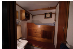
Single Cabin En-suite