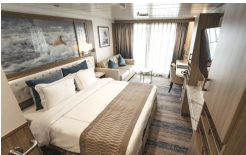
Balcony Stateroom - A