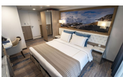
Balcony Stateroom - B