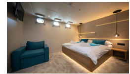
Upper Deck VIP Cabin