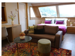
Upper Deck cabin with Terrace