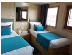
Main Deck Cabin - Twin Cabins