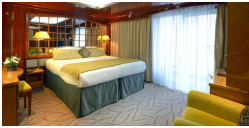
Magellan Deck Standard Single