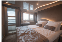
Upper deck balcony cabin