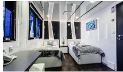
Upper Deck Cabin with Balcony