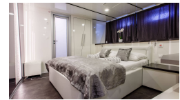
Main Deck Cabin (one available)