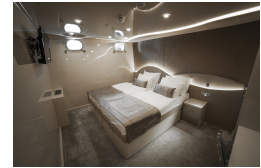
Upper Deck Cabin with Balcony VIP