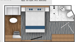
Category G Stateroom - Single Stateroom (Porthole)