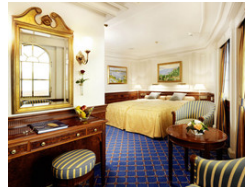
Category D. From