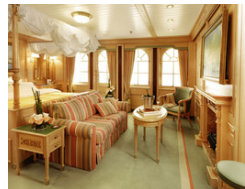
Category B. From