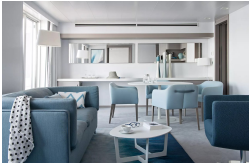
Prestige Deck 5