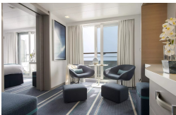
Prestige Deck 4